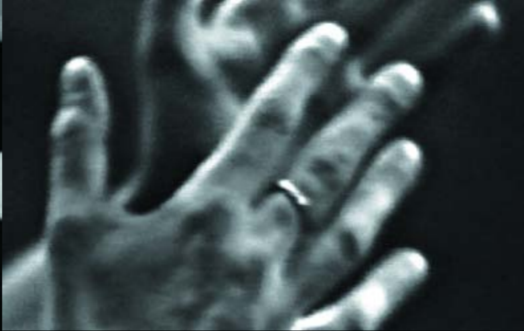
Janusz Szczerek Zakłócenie [Disturbance] 1979