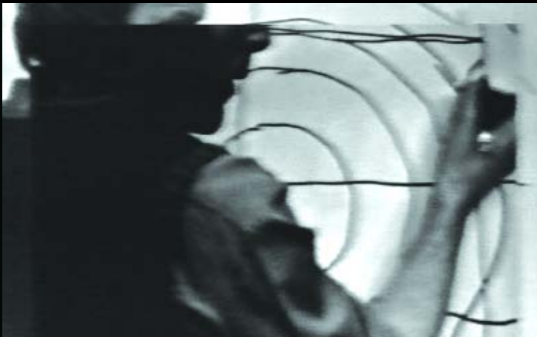
Pawel Kwiek Video P 1975 -77