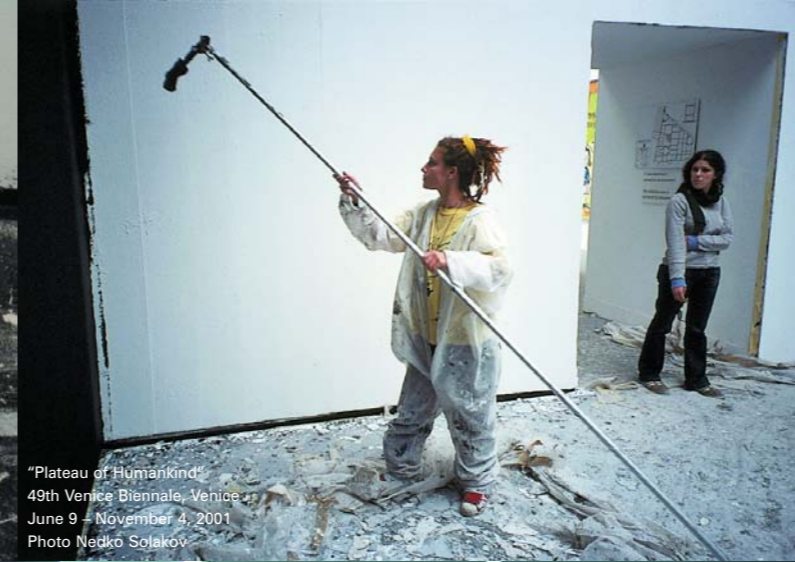
"Plateau of Humankind" 49th Venice Biennale, Venice June 9 – November 4, 2001