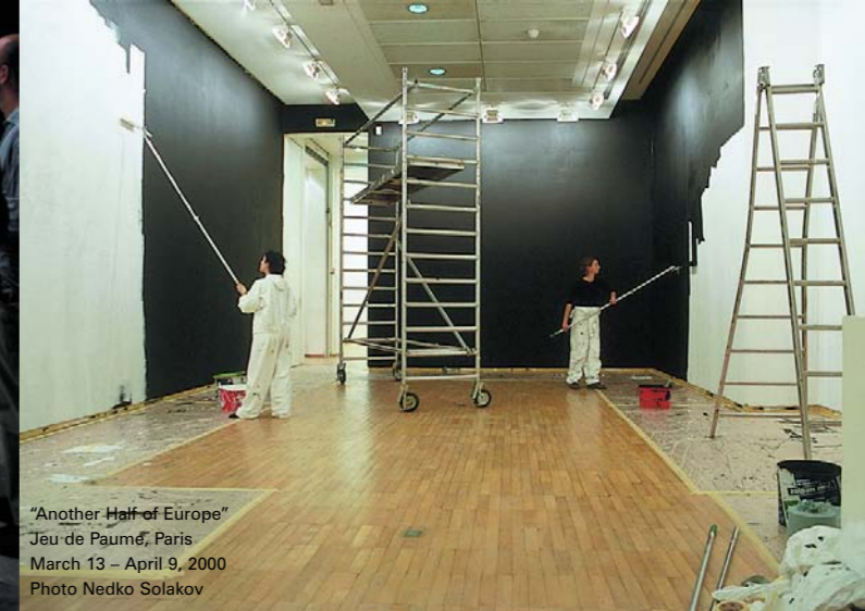
"Another Half of Europe" Jeu de Paume, Paris March 13 – April 9, 2000