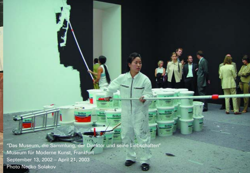
"Das Museum, die Sammlung, der Direktor und seine Liebchaften" Museum für Moderne Kunst, Frankfurt September 13, 2002 – April 21, 2003