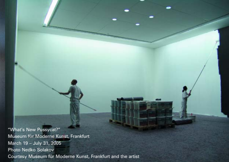
"What's New Pusycat?" Museum für Moderne Kunst, Frankfurt March 19 – July 31, 2005