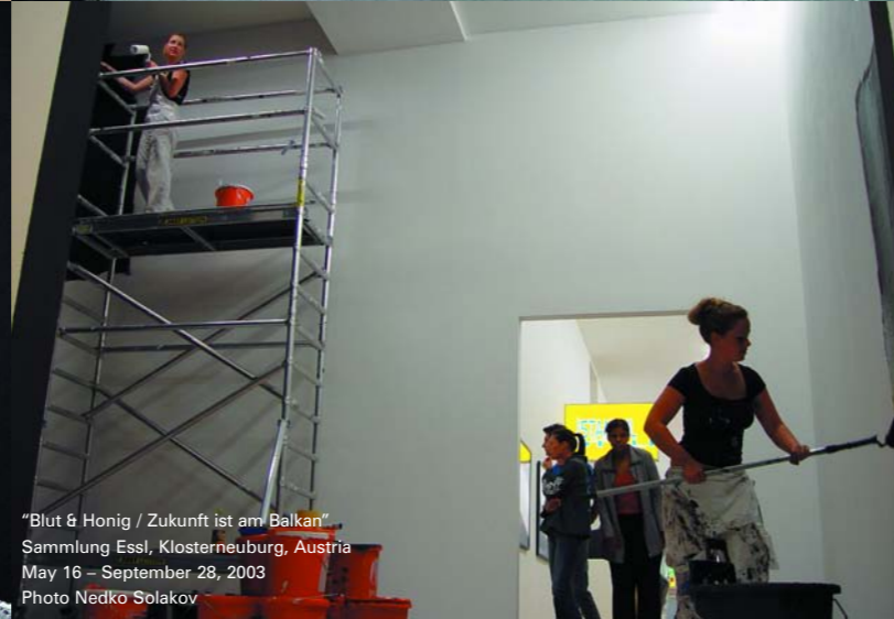
"Blut & Honig / Zukunft ist am Balkan" Sammlung Essl, Klosterneuburg, Austria May 16 – September 28, 2003