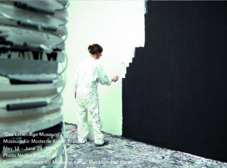
"Das Lebendige Museum" Museum für Moderne Kunst, Frankfurt May 17 – June 29, 2003

tel. +44 (0)1603 756247 fax. +44 (0)1603 615728 info@norwichgallery.co.uk www.norwichgallery.co.uk