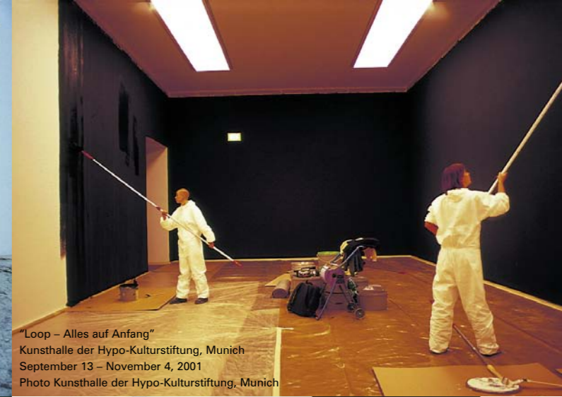
"Loop - Alles auf Anfang" Kunsthalle der Hypo-Kulturstiftung, Munich September 13 – November 4, 2001