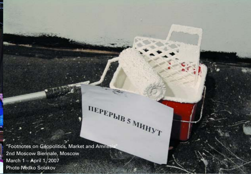
"Footnotes on Gaopolitics, Market and Amnesia" 2nd Moscow Biennale, Moscow March 1 – April 1, 2007