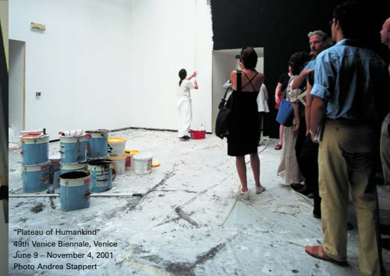
"Plateau of Humankind" 49th Venice Biennale, Venice June 9 – November 4, 2001