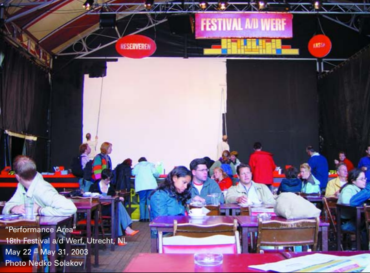
"Performance Area" 18th Festival a/d Wurf, Utrecht, NL May 22 – May 31, 2003