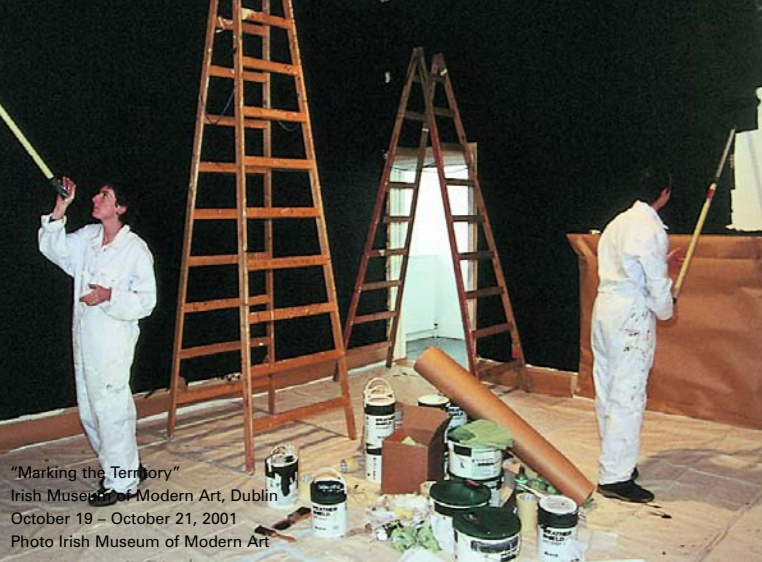
"Marking the Territory" Irish Museum of Modern Art, Dublin October 19 – October 21, 2001