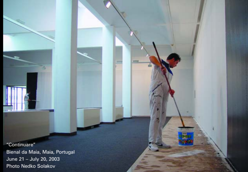
"Continuare" Bienal da Maia, Maia, Portugal June 21 – July 20, 2003 Photo Nedko Solakov

Edition of 5 and 1 AP Collections of Peter Kogler, Vienna; Susan and Lewis Manilow, Chicago; Sammlung Hauser und Wirth, St. Gallen; Museum für Moderne Kunst, Frankfurt am Main Courtesy the artist