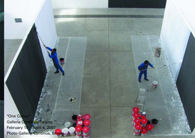
"One Colour" Galleria Continua, Beijing February 10 – April 4, 2007